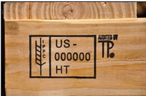
Heat Treated ISPM 15 Compliant Stamp (Required for shipments going to Harlingen, TX)