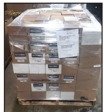
Properly secured/labeled pallet